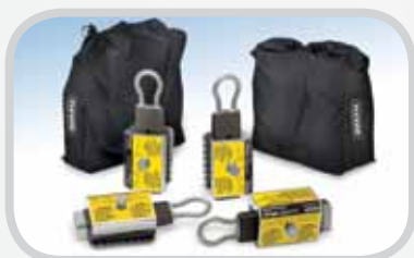
Smart Clamp™ Light-Duty Belt Clamps