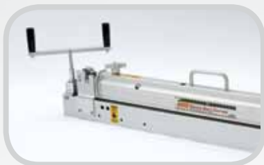
Flexco Belt Cutting Tools

The Flexco Laser Belt Square can be used in conjunction with many Flexco products, including: