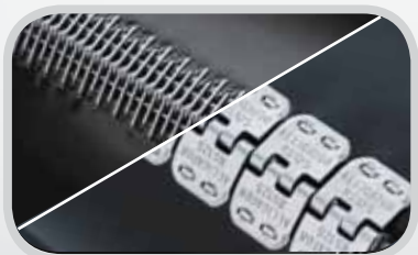
Clipper® and Alligator® Belt Fastening Systems