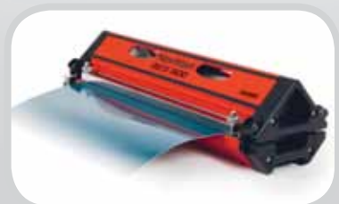
Novitool® Belt Fabrication Tools